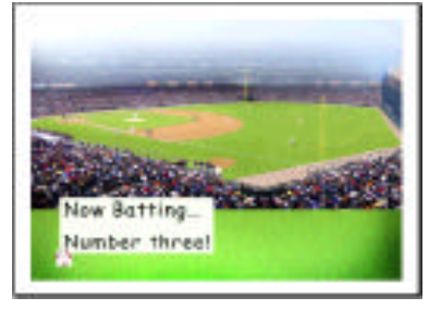
Play Ball by Jerry Stemach

New BuildAbility stories truly high interest / really low vocab!